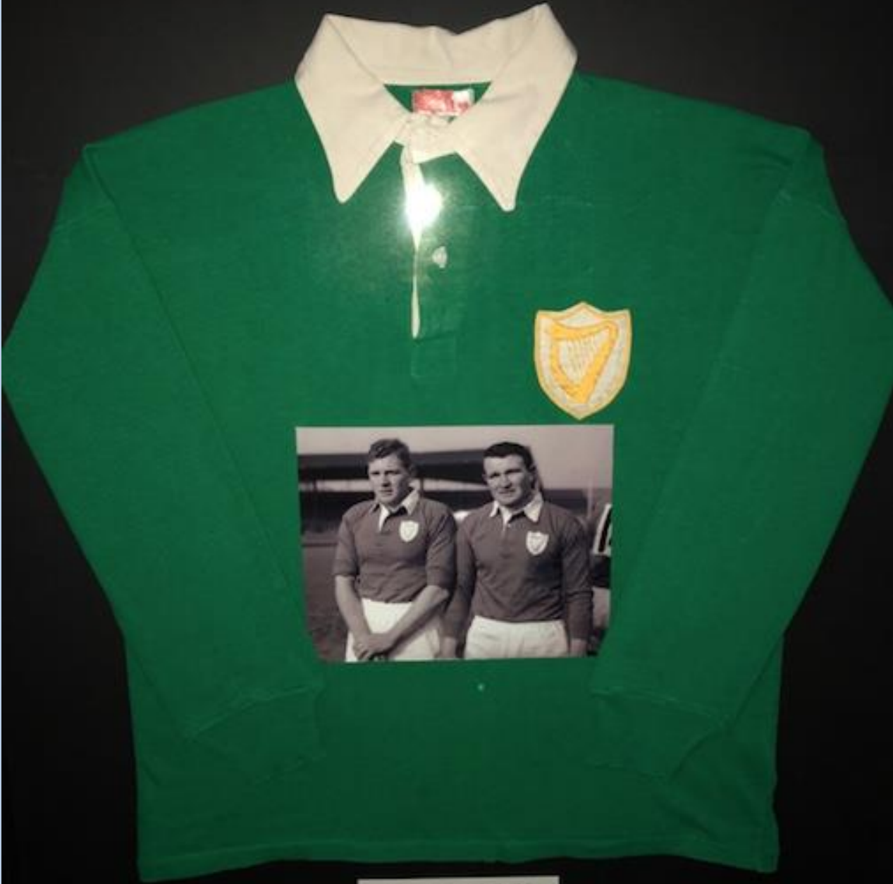
Laois jersey worn by The Toiry on St. Patrick's Day 1916 when he became the only player ever to win Railway Cup Medal in hurling and football on the same day.