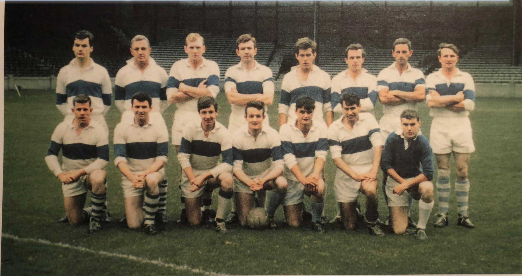
Dublin Senior Football Champions 1967