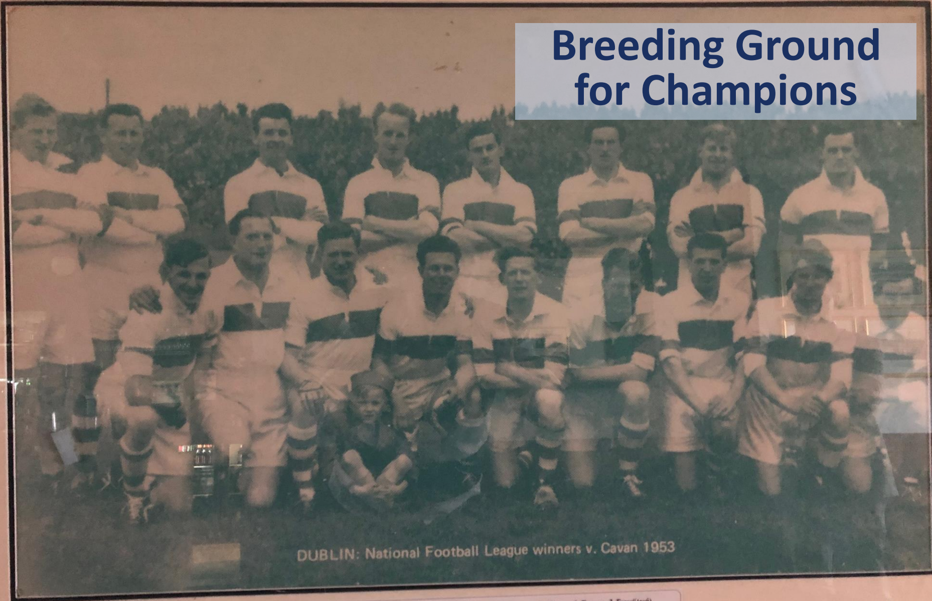
DUBLIN: National Football League winners v. Cavan 1953