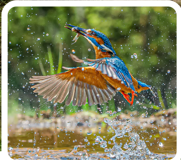
Picture of the kingfisher