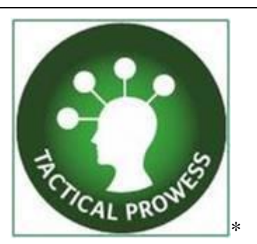
T2 – Tactical Prowess

• Continue the refinement of skills to achieve autonomous performance in match conditions